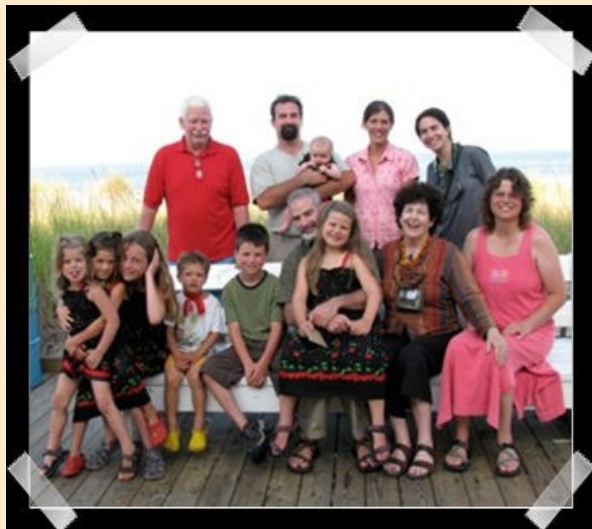
This moose. no longer loose! When my first

Surprises are such fun! Grandpa plus 2: weeded, planted geranium and hosta, watered, mulched . . . then re-surfaced three long pebbled stair flights from driveway down-hill to house ... Won't this surprise Dad, we asked? Thinking, His clients will get a less hard-scrabble office-entry impression. Grandma + 2: sewed matching August vacation-week dresses for 5 cousins (picture), visited lots over it, and cooked. The routine? (Grandpa had 2 years at West Point): All break from work in the late afternoon for a cooling dip, suppers they - good cooks all - help, by turn, prepare - and rousing rounds of "Spy Alley" (great board game) before bed. (OK, Grandma neither swam nor played games, but stitched and kept company.) We were all blessed by gorgeous weather!